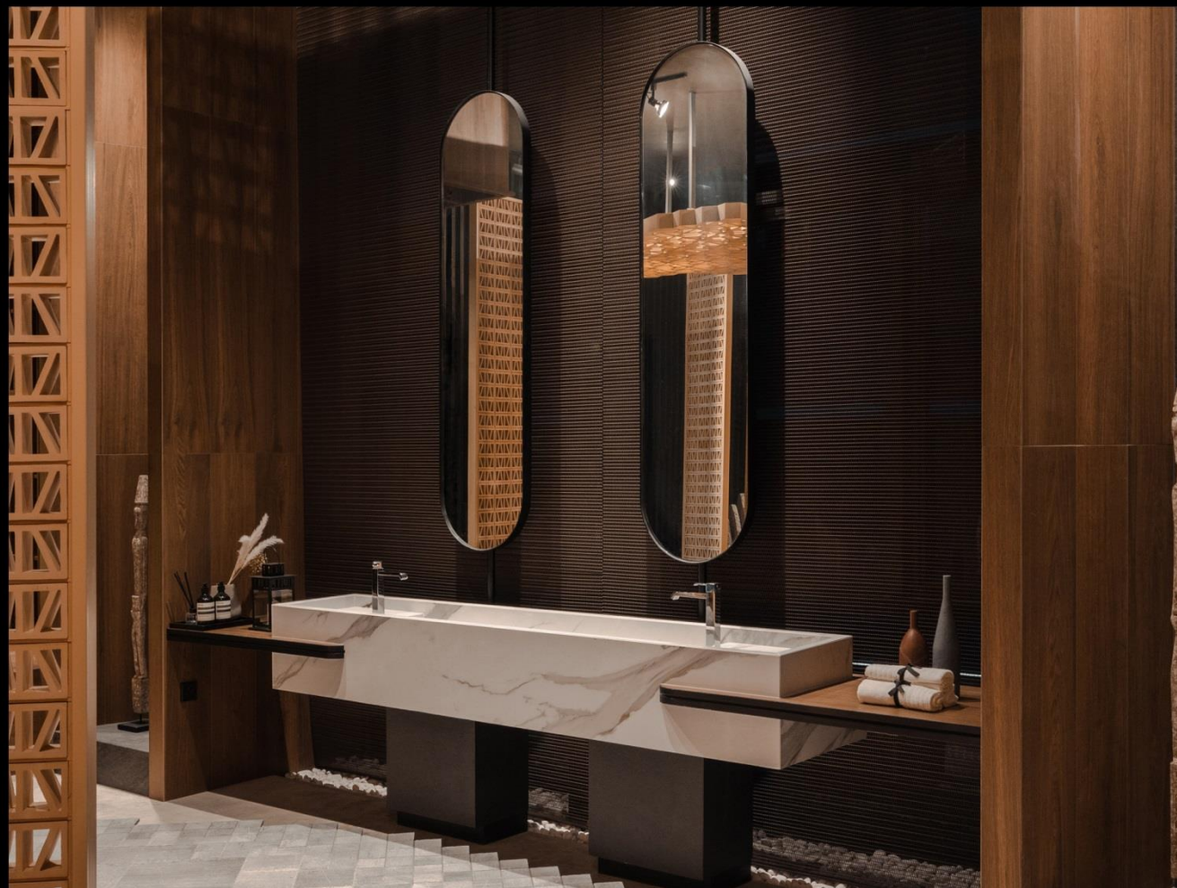
Basin CP 02 SLK SQ Countertop Tanzania Walnut Rect Vanity Stand 6 Concrete Graphite