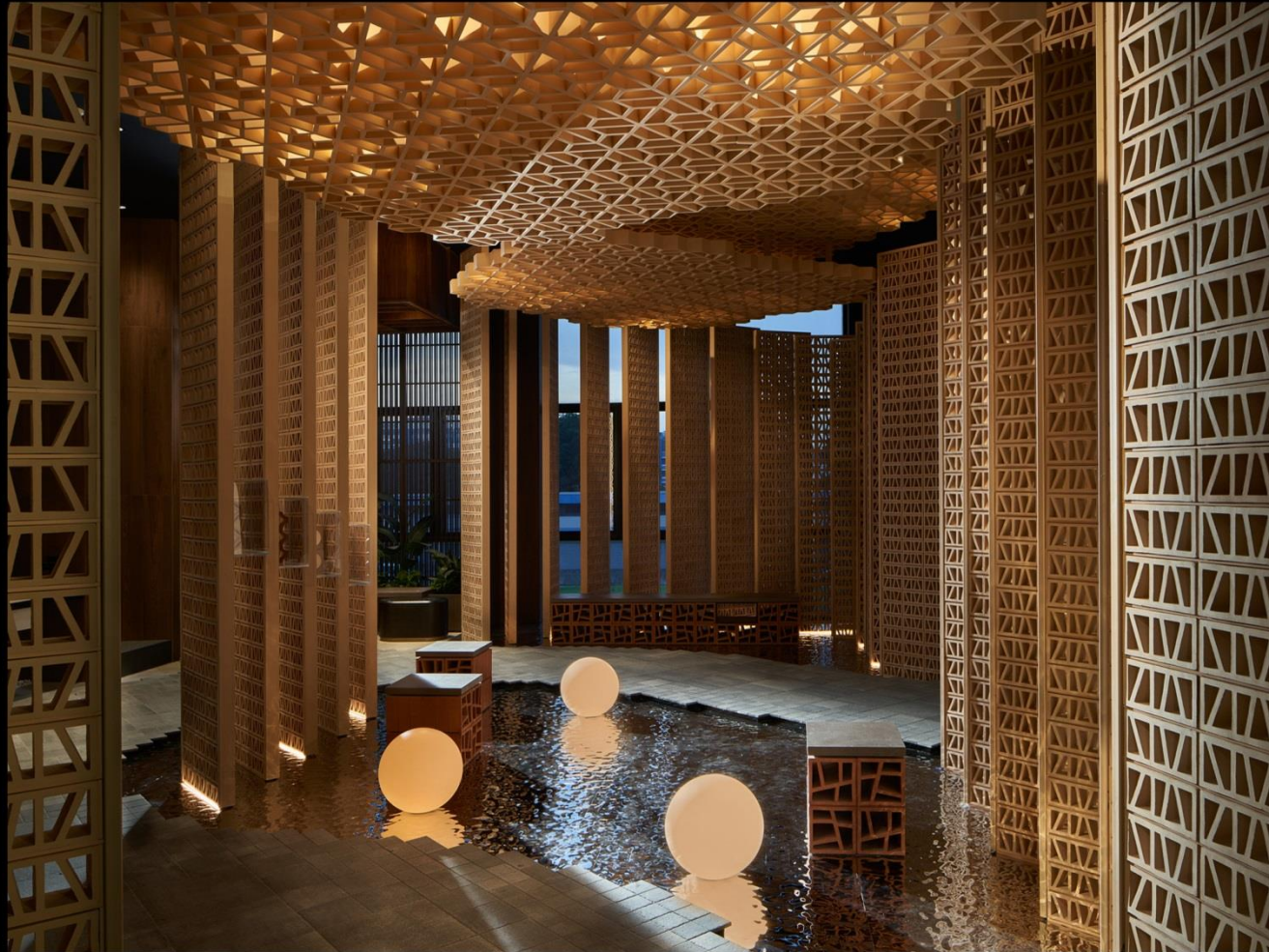
Floor Due Maestrá 15mm (40) Breezeblocks Sitges Arena 14 Stools Trencadis Rojo 15