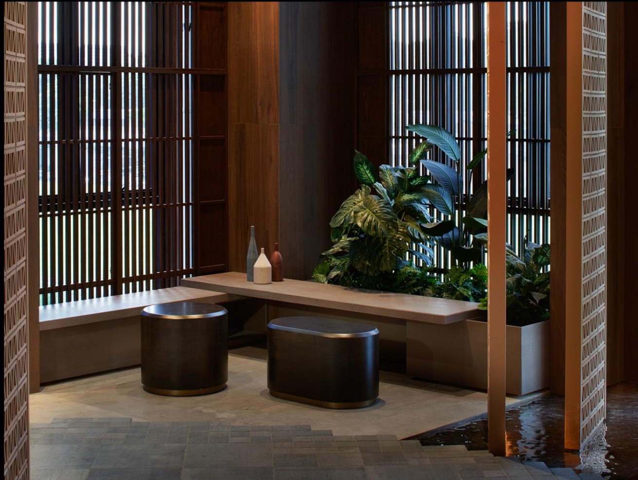
Floor Action Light Ret Bench Top 6 Concrete Mud