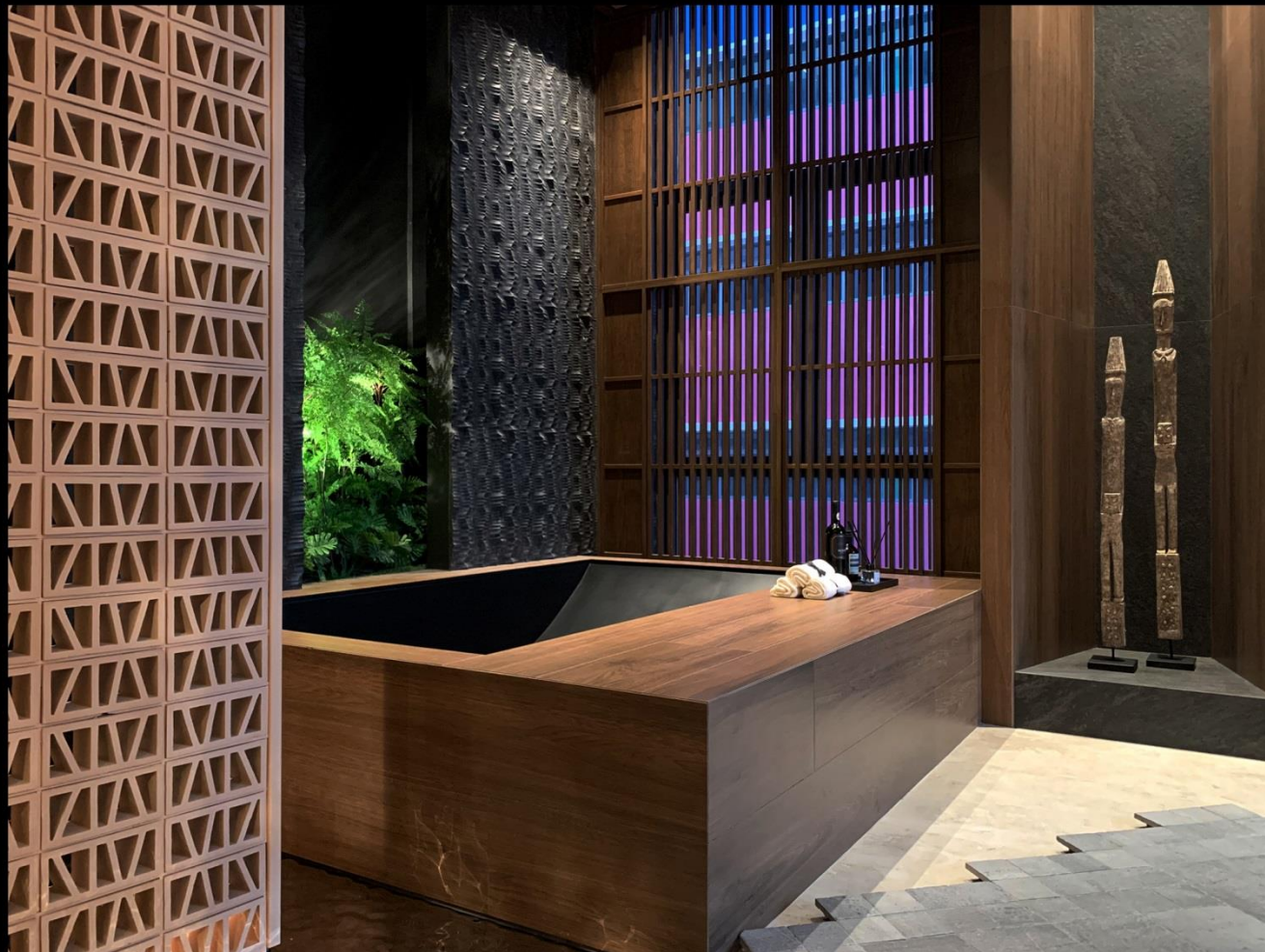
Wall BV.Coke Feature Wall Hedonism Ikran Makrame Pool Tanzania Walnut Rect