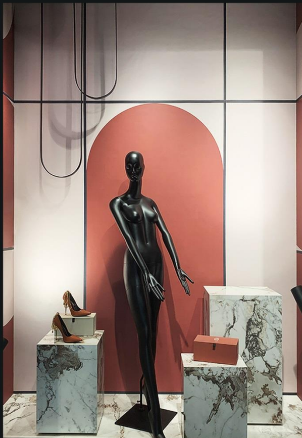
Wall Arco Mattone Cipria, Cornice Cipria, Volta Mattone Cipria Stools & Floor Breccia