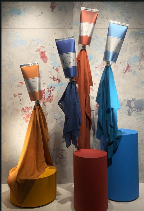
Wall Archeologie Floor Bianco