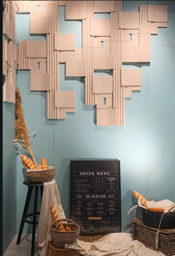
Modular Wall Feature Rilievi #3 Tortora Wall Salvia Floor Sabbia