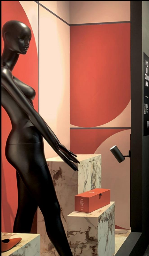
Right Wall Kli.Dark Rt Floor Carbon 6PLS