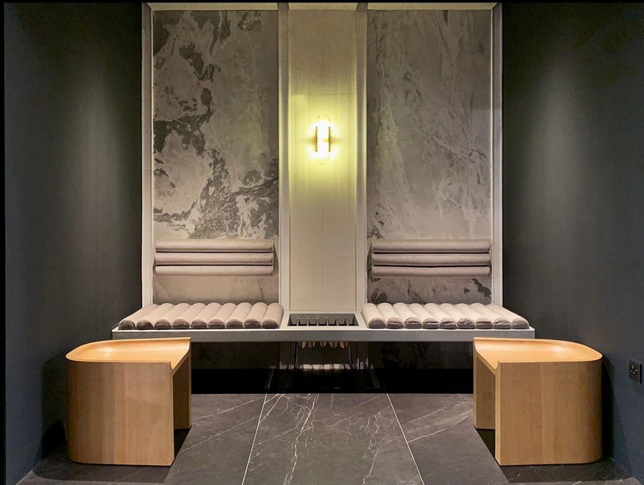
Wall Onyx More Wht Blend Sat & Bamboo Crema d'Orcia Select Floor Max Pietra Grey